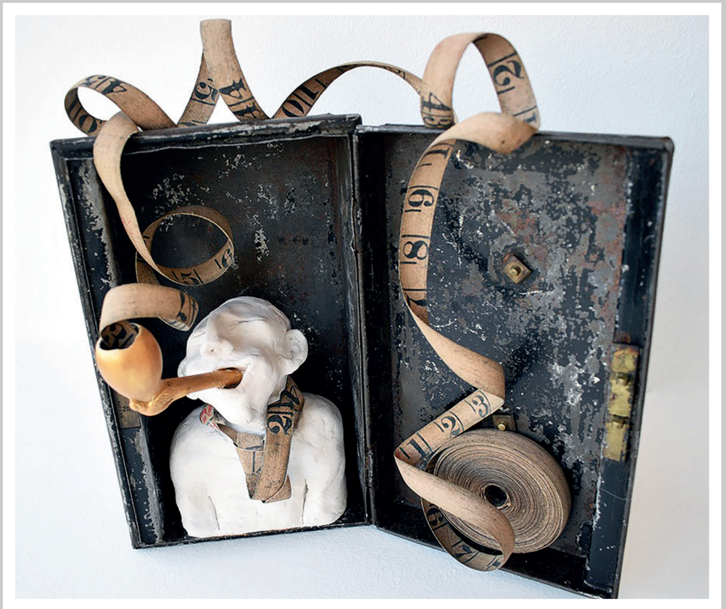
Pipe Dream Clay & Found Objects