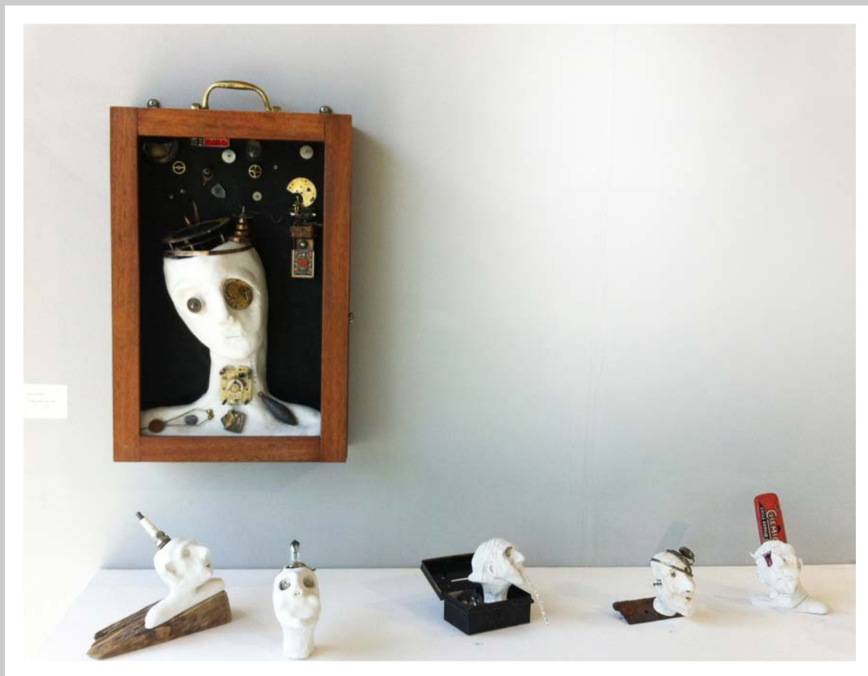
Heads from the Murmurations exhibition Clay & Found Objects